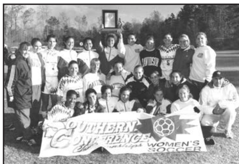
In 1996, Davidson won both the SoCon regular-season title and the tournament crown.

1 SoCon Tournament; Davidson, N.C. (campus site)