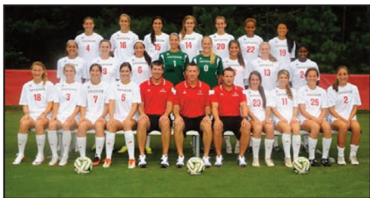
It was a new era for the program as the 2014 team was the first squad to play in the Atlantic 10.