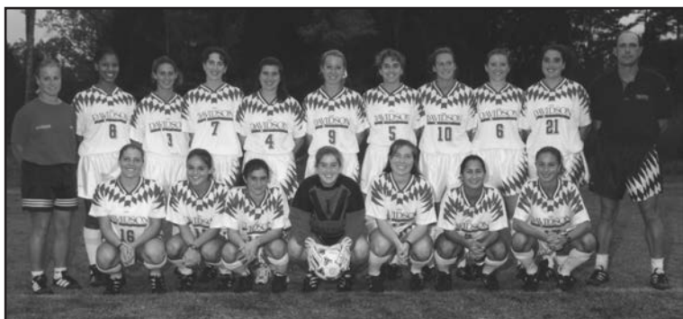
The 1995 squad shut out Furman 3-0 in the finals to capture the SoCon tournament title.