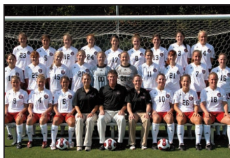
The 2007 squad tied the school record for wins in a season with 14 and also matched the school mark for shutouts by blanking 10 opponents.