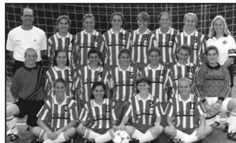
Regular-season and SoCon Tournament champs, the 1994 Wildcats were the first in program history to capture both titles in the same year.